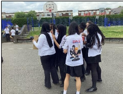
Image of pupils deleted.