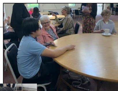
Image of pupils deleted.