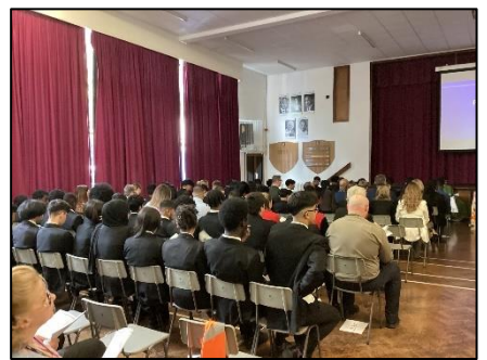
Image of pupils deleted.